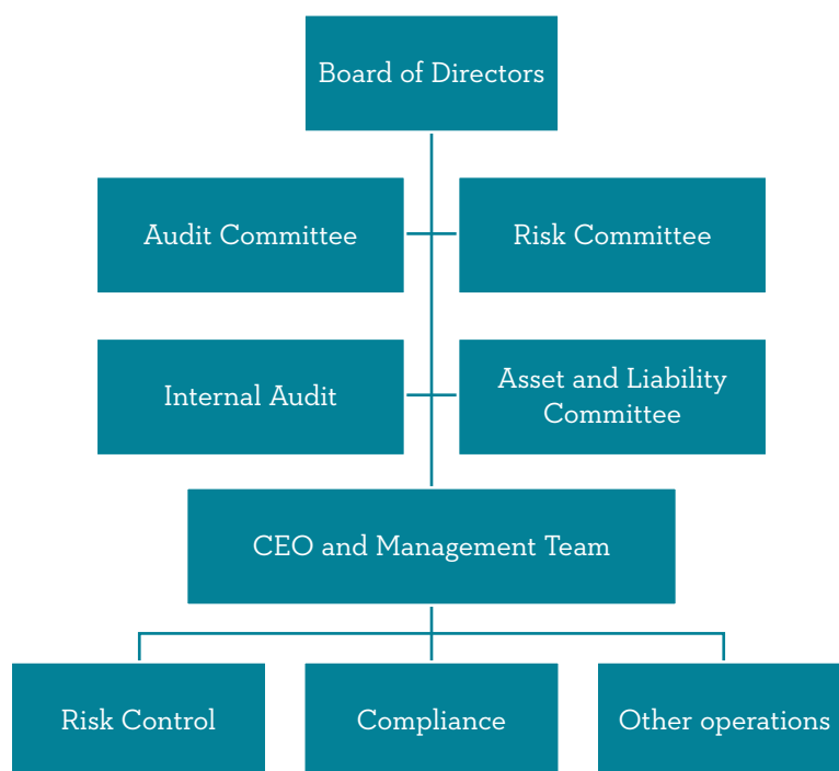
Chart: Risk management governance of the Central Institution

The internal audit of the Central Institution verifies through its independent activity that the Board of Directors of the Central Institution and its Audit Committee have access to a correct and comprehensive view of the profitability, efficiency, state of internal control and diverse operational risks of the Savings Bank Group and Savings Banks Amalgamation.