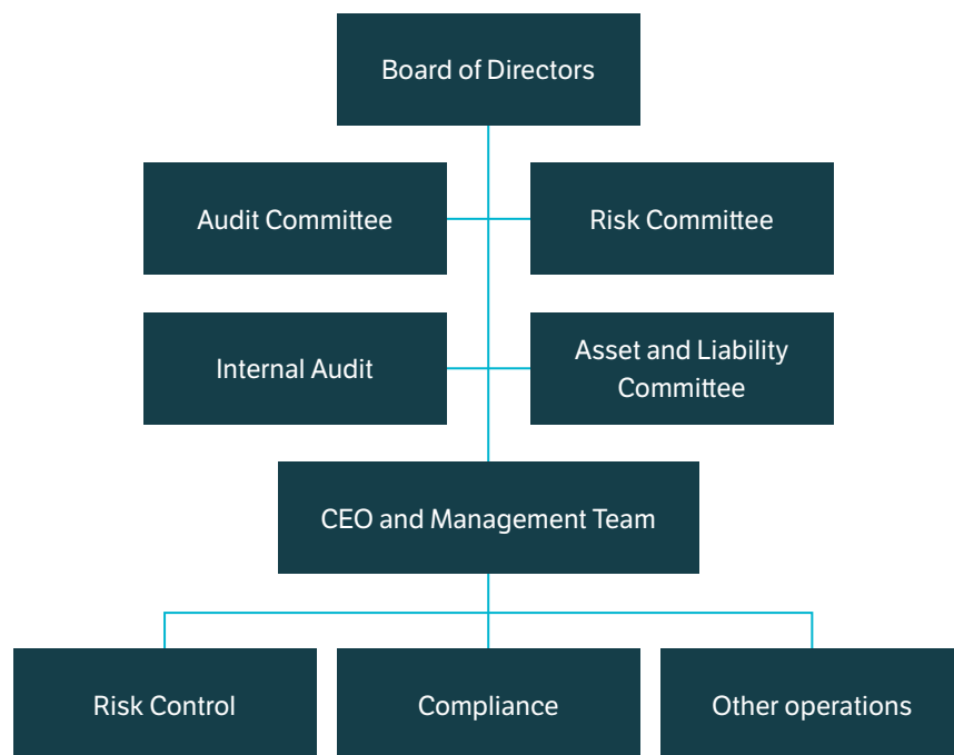
Chart: Risk management governance of the Central Institution

The internal audit of the Central Institution verifies through its independent activity that the Board of Directors of the Central Institution and its Audit Committee have access to a correct and comprehensive view of the profitability, efficiency, state of internal control and various operational risks of the Savings Banks Group and the Savings Banks Amalgamation. The chart below illustrates the risk management organisation of the Central Institution.